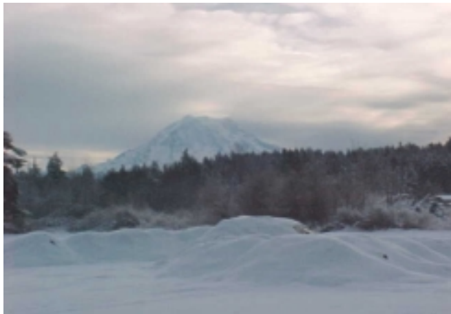
An irresistible shot from the Bethel jobsite on 01/05/04. We'll try to show you this angle again – maybe with some changes in the foreground!