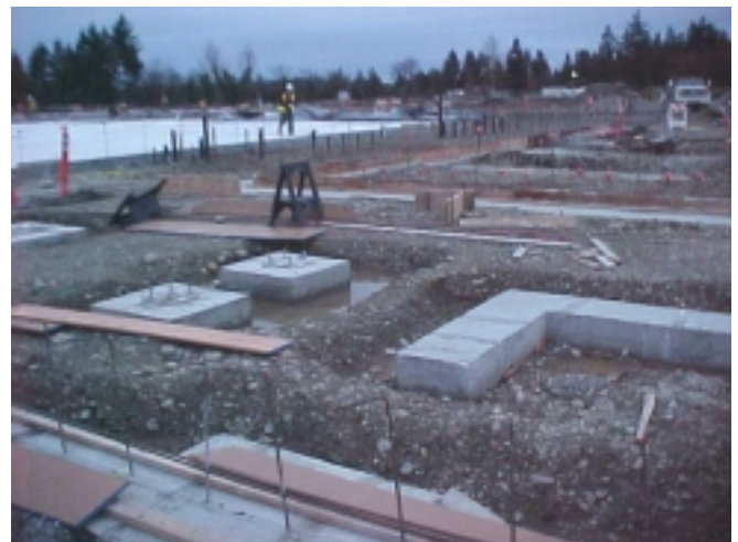
Mid-December – Area A Footings Well Underway

This $29 Million, 177,000 SF project is well underway, with site clearing activities complete and footings being poured for the Area A walls. The mason is mobilizing and structural steel should start arriving around the end of January. Underground work is progressing in Area B, with a slight hindrance due to various weather conditions, see photo on next page.