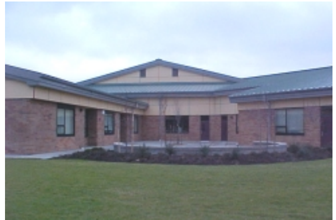
West Courtyard on a cold winter day.

This project will be tied up by the end of January and here are a few parting shots.