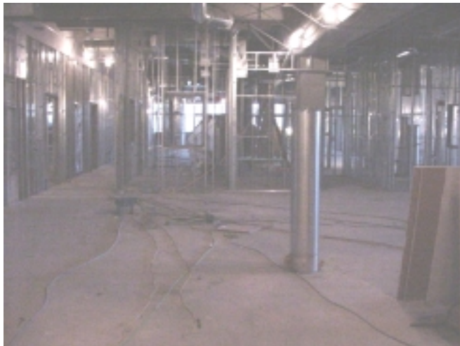
Wall Framing in Progress . . . .

This $4.6 million project is contained within the existing NSCC structure (the NE corner of the building as you're passing by on I-5). Changes to the facility include gutting approx. 35,800 SF of existing Art & Science classrooms, prep areas, and laboratories, to make way for all new interior walls for classroom & lab areas.