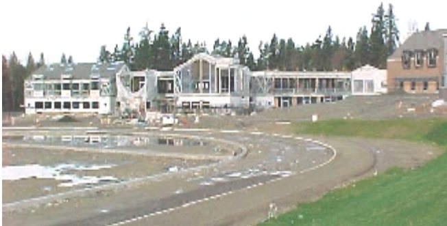
South End of the Building

Work on this $25 million, 160,000 SF project is already 56% complete.