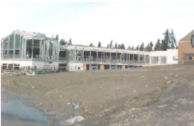
Upper Level West